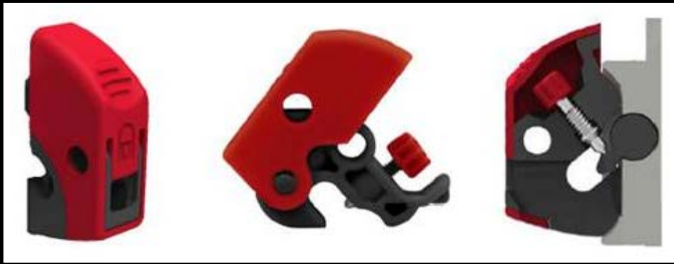
S2394 : Universal Mini Circuit Breaker Lockout