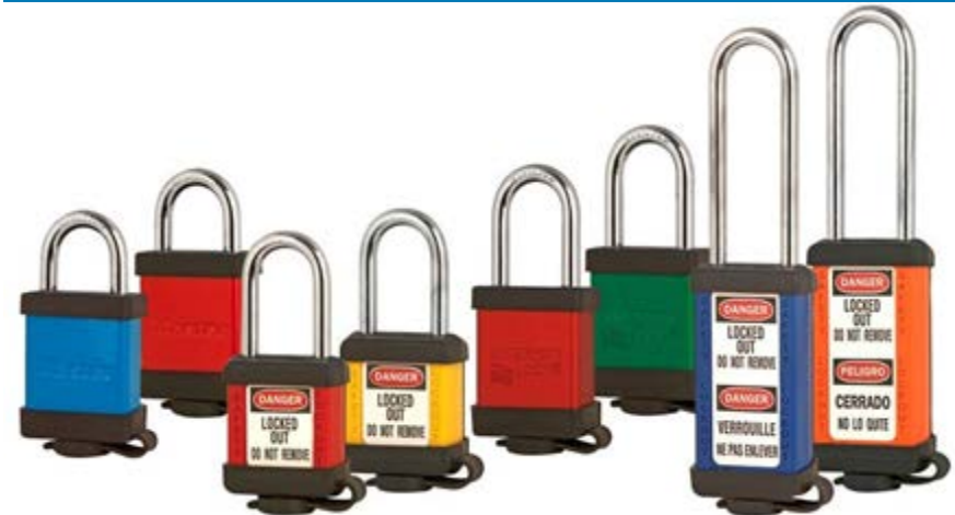
Safety Padlock Cover Family