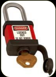
S101 Cover Applied to A1105 Padlock