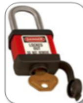
S101 Cover Applied to A1105 Padlock