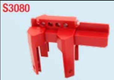
S3080 Adjustable Ball Valve Lockout