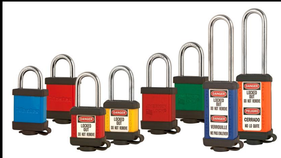
Safety Padlock Cover Family