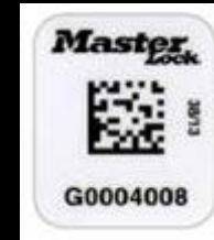
High Frequency RFID Label